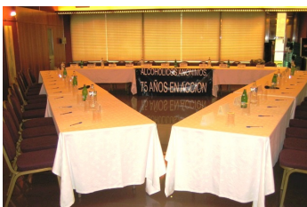
President, custodian's & delegate's tables

all people for all time who have an alcoholic problem may enter these halls unasked and feel welcome. We need it to ensure that Alcoholics Anonymous never asks of anyone who needs us what his or her race is, what his or her creed is, what